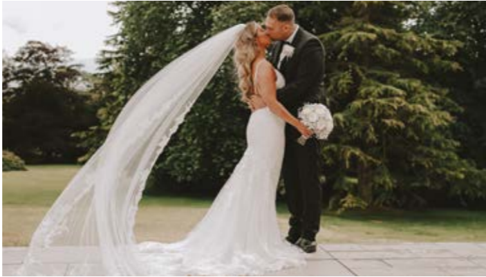
HETLAND HALL DUMFRIES

The Multi-Award Winning, Lochside House Hotel & Spa, is a hidden Scottish gem, set in the tranquility of the picturesque Ayrshire countryside.