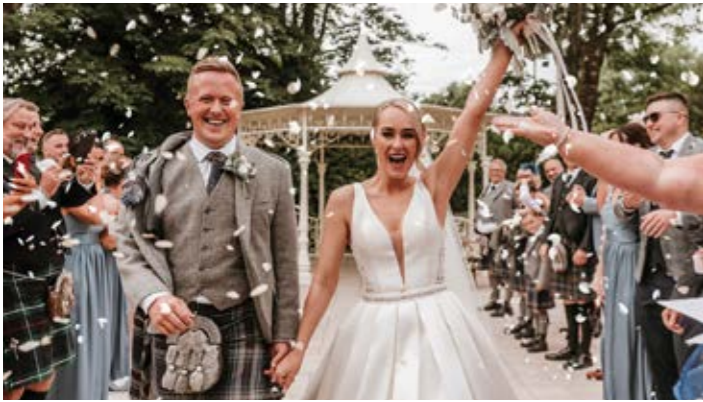
DALMENY PARK GLASGOW

Brig o' Doon is an iconic venue set amidst several acres of perfectly manicured gardens and grounds. Located in the heart of historic Ayrshire it is one of Scotland's most well-known wedding venues.