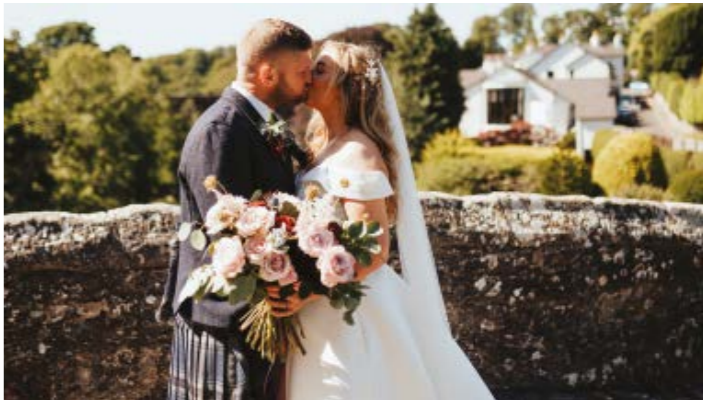
BRIG O' DOON ALLOWAY

Centrally located for easy access to Ayr & Prestwick. The Carlton Hotel Prestwick boasts beautiful landscaped gardens providing a picturesque backdrop for your wedding.