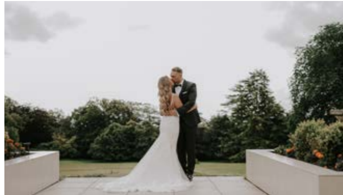
HETLAND HALL DUMFRIES

Seamill Hydro is a romantic Victorian venue with mesmerising views of the Firth of Clyde and Mountains of Arran, making it the perfect setting for your special day.