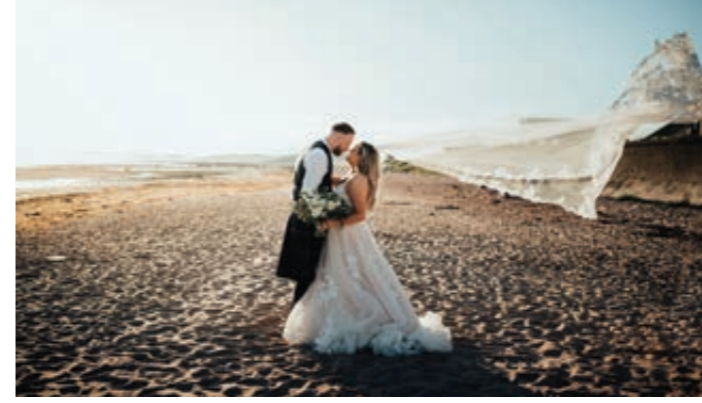
SEAMILL HYDRO WEST KILBRIDE

Brig o' Doon is an iconic venue set amidst several acres of perfectly manicured gardens and grounds. Located in the heart of historic Ayrshire it is one of Scotland's most well-known wedding venues.