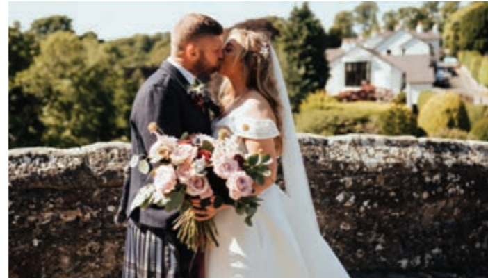
BRIG O' DOON ALLOWAY

The Radstone Hotel South Lanarkshire, set in its own extensive grounds, with breathtaking panoramic views of the Clyde Valley is the perfect place to Say I do. The luxurious modern interiors must be seen to be believed.