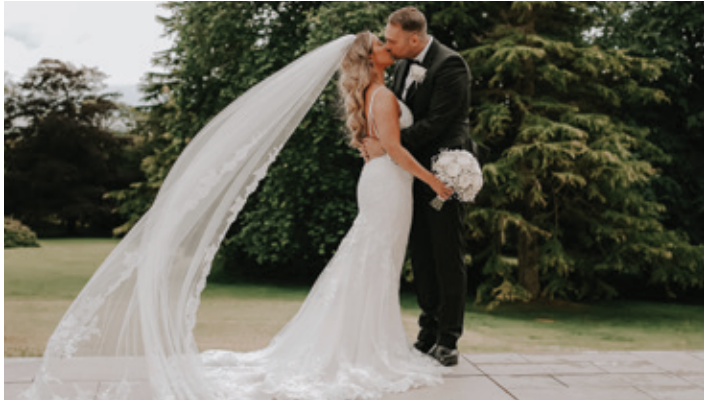
HETLAND HALL DUMFRIES

The Radstone Hotel is tucked away in rural Lanarkshire. Set in its own extensive grounds with striking scenery and landscaped gardens.