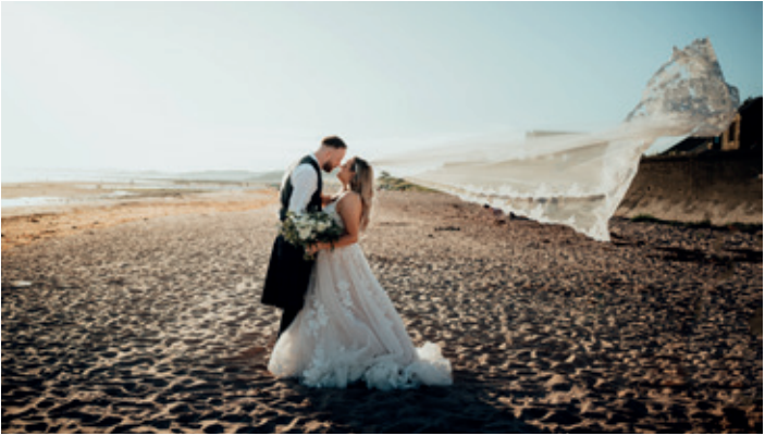
SEAMILL HYDRO WEST KILBRIDE

Brig o' Doon is an iconic venue set amidst several acres of perfectly manicured grounds. Located in the heart of historic Ayrshire, it is one of Scotland's most well-known venues.