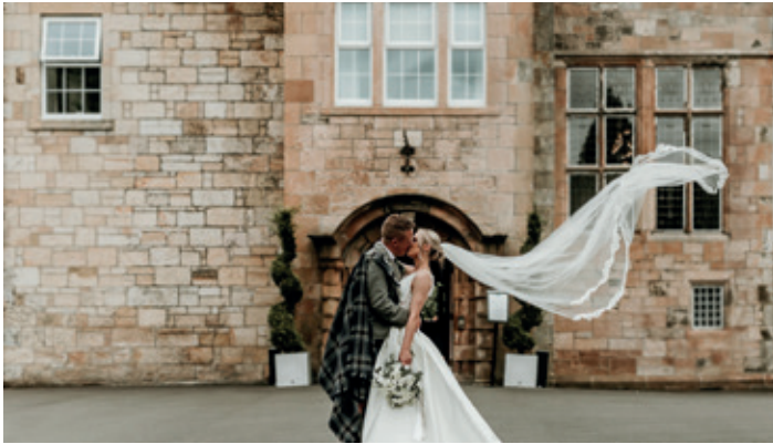
DALMENY PARK GLASGOW

Seamill Hydro Hotel is a romantic Victorian venue with mesmerising views of the Firth of Clyde and Mountains of Arran, making it the perfect setting for your special day.