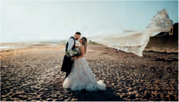
SEAMILL HYDRO WEST KILBRIDE

Brig o’ Doon is an iconic venue set amidst several acres of perfectly manicured grounds. Located in the heart of historic Ayrshire, it is one of Scotland’s most well-known venues.