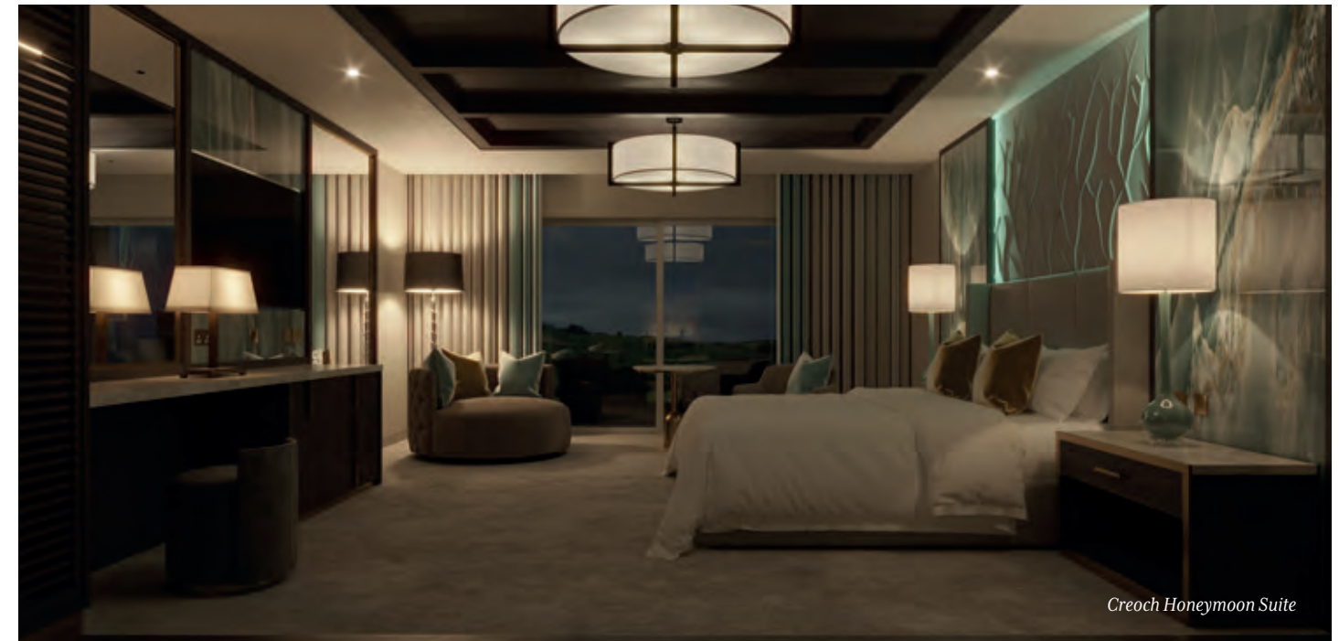
Creoch Honeymoon Suite

Upgrade to our Creoch honeymoon suite, overlooking the Loch of Lowes, Creoch Loch and Afton Hills, the perfect ending to the most magical day of your life.