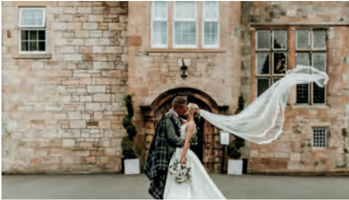
DALMENY PARK GLASGOW

Seamill Hydro Hotel is a romantic Victorian venue with mesmerising views of the Firth of Clyde and Mountains of Arran, making it the perfect setting for your special day.