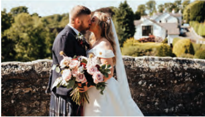
BRIG O’ DOON ALLOWAY

Hetland Hall Hotel is an elegant country house set amidst picturesque gardens and grounds. The romantic ceremony suite offers sweeping views of the Solway Firth with stylish interiors, we can think of no better setting.