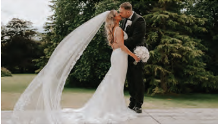
HETLAND HALL DUMFRIES

The Radstone Hotel is tucked away in rural Lanarkshire. Set in its own extensive grounds with striking scenery and landscaped gardens.