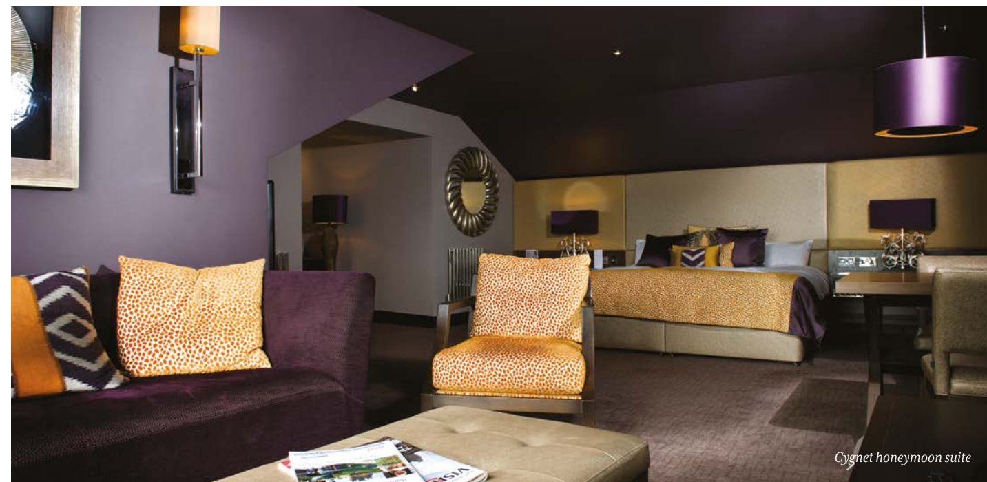
Cygnet honeymoon suite

Upgrade to our Cygnet honeymoon suite, overlooking the Loch of Lowes and Afton hills, the perfect ending to the most magical day of your life.