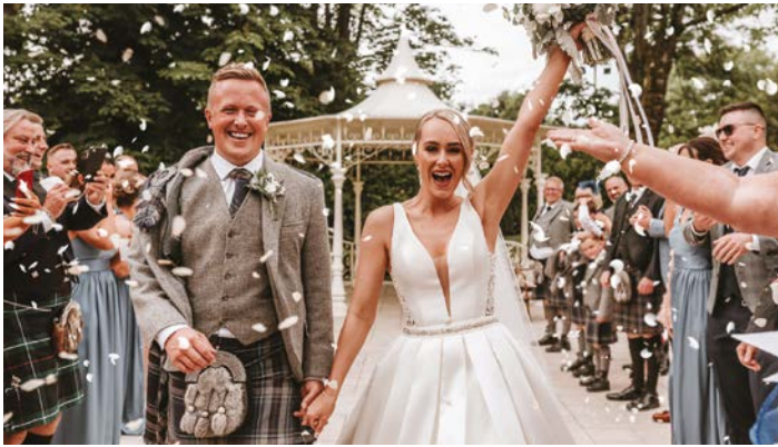
DALMENY PARK GLASGOW

Brig o' Doon is an iconic venue set amidst several acres of perfectly manicured gardens and grounds. Located in the heart of historic Ayrshire it is one of Scotland's most well-known wedding venues.