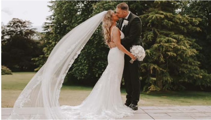
HETLAND HALL DUMFRIES

Dalmeny Park is an impeccable Scottish Mansion set amidst several acres of magnificent gardens and grounds.