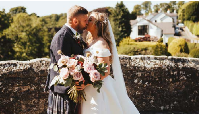
BRIG O' DOON ALLOWAY

Centrally located for easy access to Ayr & Prestwick. The Carlton Hotel Prestwick boasts beautiful landscaped gardens providing a picturesque backdrop for your wedding.