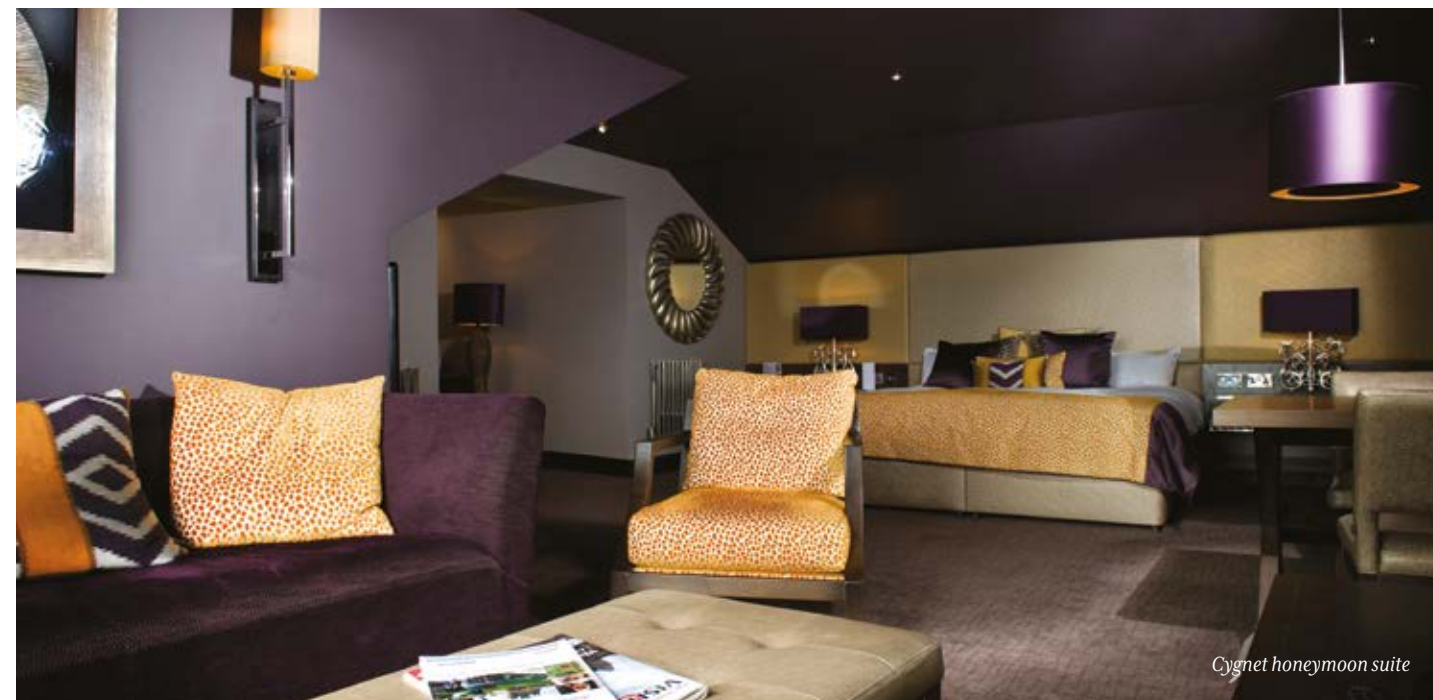
Cygnet honeymoon suite

Upgrade to our Cygnet honeymoon suite, overlooking the Loch of Lowes and Afton hills, the perfect ending to the most magical day of your life.